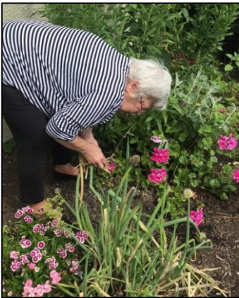
Tending the flower garden

We believe this will make things easier and more convenient for you, and save time when visiting.