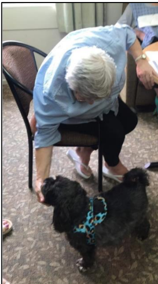
Enjoying some doggy company