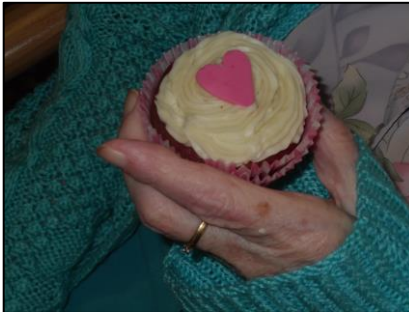
A resident enjoys a delicious cupcake on Valentine's Day

We hope to have some specific and exciting new initiatives to share in future newsletters as the project progresses.