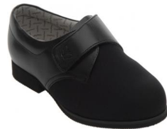
A practical shoe that ticks all the boxes