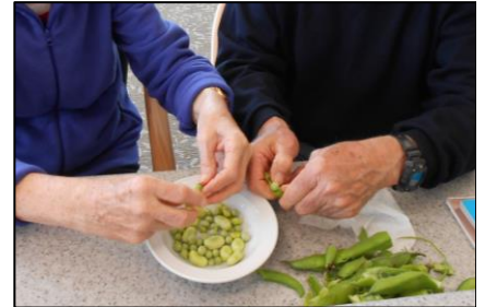
Pleasure in sharing the familiar activity of shelling peas

“Some food had fallen on the floor at lunch time and I was on hands and knees picking it up from under the table. Two gentlemen were watching me. One said to the other, “Look at her! She must be hungry – she’s getting food off the floor!” The joke had the two of them chuckling away and put a big smile on my face too!”