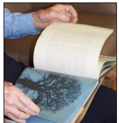
Books can be enjoyed alone or shared with a friend

If the time of the appointment does not suit you please discuss this also with the RN and they will liaise with the service provider to change the time if possible.