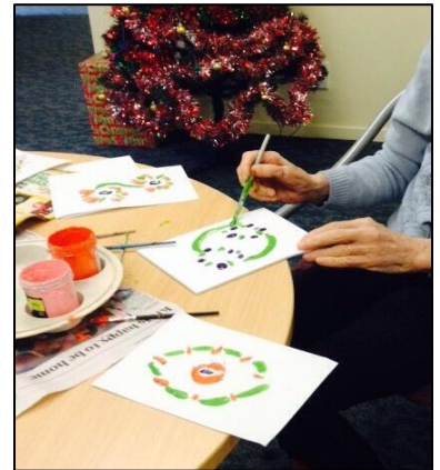
Art and craft offer the opportunity for creativity and achievement

The small miracles our diversional therapy staff achieve are hard to come by, and the process is demanding, emotionally draining, exhausting, exciting, uplifting ... and, to the rest of us, at times almost invisible.