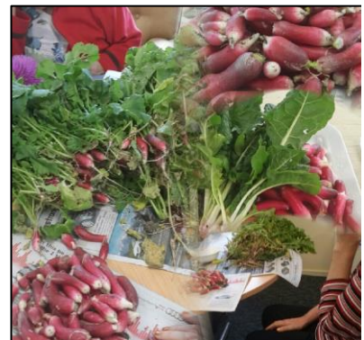
Harvest time: produce from our vegetable garden

We are on Facebook! Visit our website at