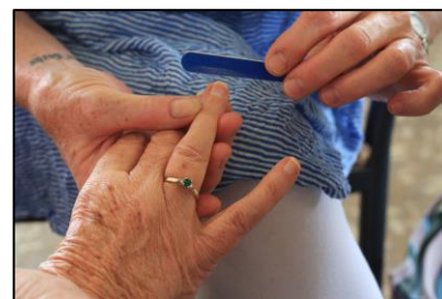
The simple pleasure of a manicure

Please choose to vaccinate this winter, and help your loved one stay well!