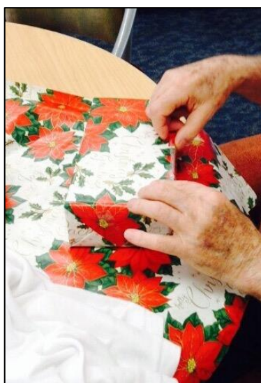
A gentleman wraps a Christmas gift