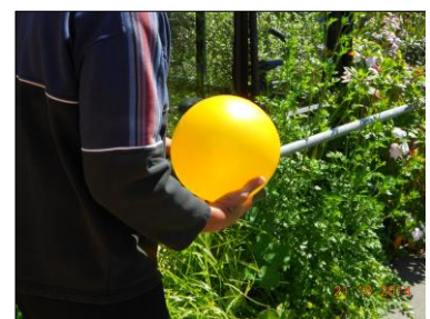
Residents enjoy ball games in the courtyard during the summer months