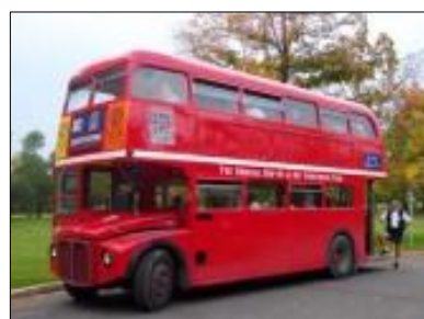
Large-piece jigsaw puzzles reflecting adult interests are available over the Internet

The tradition of giving a gift at Christmas time can be challenging when your family member or friend has dementia. The Alzheimers Association has shared the following excellent suggestions for gifts suitable for every level of care. Early stage games and activities should reflect the person's interests and challenge them to exercise their brain as well as their body. Later stage gifts should concentrate on providing comfort while stimulating the senses.