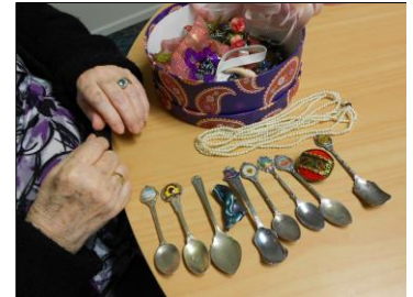
Treasure boxes offer opportunities for conversation and reminiscence

Join a dementia awareness group, or contact your local Alzheimer's organisation.