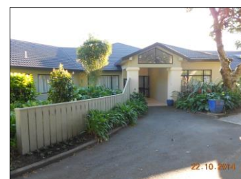
Our beautiful new entrance