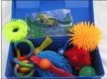
Rummage boxes are easy to compile and can also provide an opportunity for reminiscence