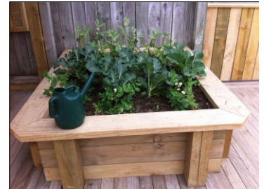
The new raised vegetable bed has made gardening easier for our residents

Join a dementia awareness group, or contact your local Alzheimer's organisation.