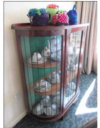
Clare's collection of tea cozies displayed above our china cabinet at Millvale

The course encourages staff to explore their own reactions and behaviour, and develop new approaches and strategies to help them enter the world of the person living with dementia.