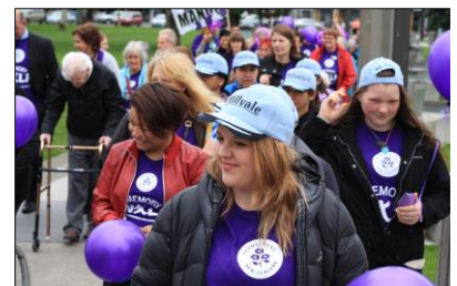
Millvale staff (in pale blue caps) enjoyed participating in the recent Alzheimers NZ Memory Walk

We look forward to developing this role further as time progresses.