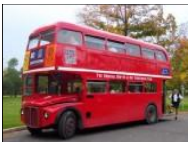
Large-piece jigsaw puzzles reflecting adult interests are available over the Internet

The tradition of giving a gift at Christmas time can be challenging when your family member or friend has dementia. The Alzheimers Association has shared the following excellent suggestions for gifts suitable for every level of care. Early stage games and activities should reflect the person's interests and challenge them to exercise their brain as well as their body. Later stage gifts should concentrate on providing comfort while stimulating the senses.