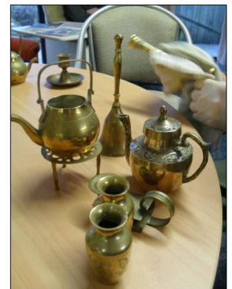
Polishing brass is an activity enjoyed by many residents at Millvale House, and provides a good opportunity for reminiscence