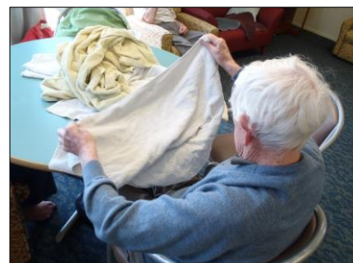
Assisting with familiar homely tasks promotes a sense of purpose and value