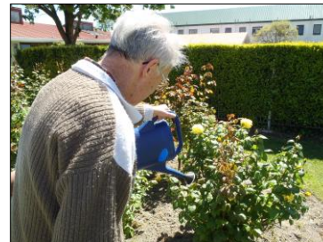
The Avonlea gardens offer many opportunities for spending enjoyable time together

Join a dementia awareness group, or contact your local Alzheimer's organisation.