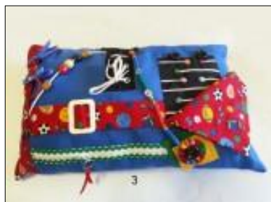
Fiddle cushions are fun to make and can reflect the interests and personality of the recipient