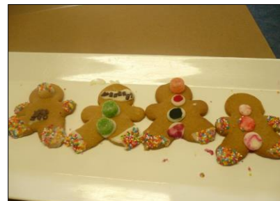
The homely activity of baking and decorating gingerbread men provides a valuable opportunity for reminiscence

The course encourages staff to explore their own reactions and behaviour, and develop new approaches and strategies to help them enter the world of the person living with dementia.