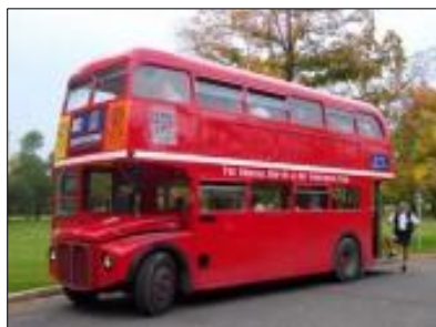
Large-piece jigsaw puzzles reflecting adult interests are available over the Internet

The tradition of giving a gift at Christmas time can be challenging when your family member or friend has dementia. The Alzheimers Association has shared the following excellent suggestions for gifts suitable for every level of care. Early stage games and activities should reflect the person's interests and challenge them to exercise their brain as well as their body. Later stage gifts should concentrate on providing comfort while stimulating the senses.