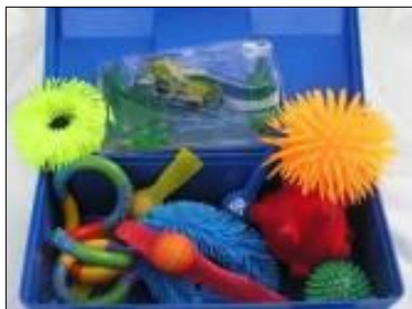
Rummage boxes are easy to compile and can also provide an opportunity for reminiscence