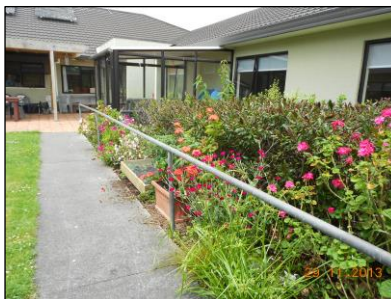
Our gardens are at their most beautiful at Christmas time

It's a magical time of the year, and we are blessed to have the opportunity to spend this time with the wonderful people in our care.