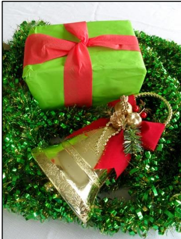
Christmas is traditional, simple and homely

Every year many of our staff leave their own families at home to help care for their other 'family' here. It is a time of closeness, laughter, special moments and much love.