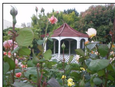
Christmas roses in bloom, Avonlea gardens, Christchurch

Christmas is always a special time in our rest homes. It's a time celebrated by our residents, families and staff together. It's an opportunity to have some lovely special events in the build up to Christmas. We all look forward to our Christmas family gathering. We have live entertainment. Our wonderful cooks excel themselves with home baked Christmas cake and mince pies and a delicious Christmas dinner.