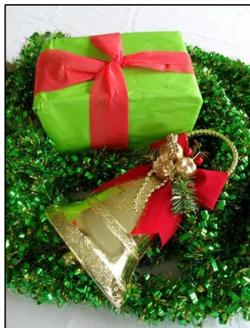
Christmas is traditional, simple and homely

Every year many of our staff leave their own families at home to help care for their other 'family' here. It is a time of closeness, laughter, special moments and much love.