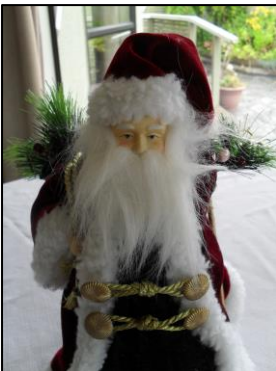
The spirit of Christmas is enjoyed by us all

Christmas is always a special time in our rest homes. It's a time celebrated by our residents, families and staff together. It's an opportunity to have some lovely special events in the build up to Christmas. We all look forward to our Christmas family gathering. We have live entertainment. Our wonderful cooks excel themselves with home baked Christmas cake and mince pies and a delicious Christmas dinner.