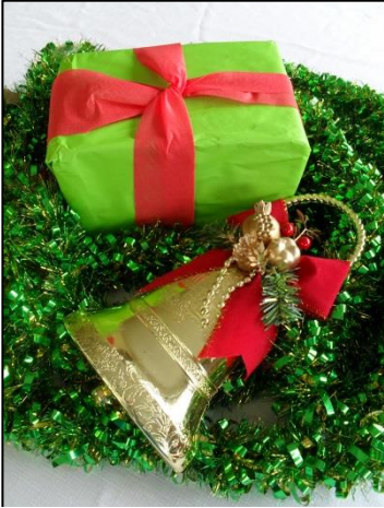
Christmas is traditional, simple and homely