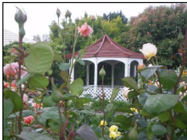
Christmas roses in bloom, Avonlea gardens, Christchurch

Christmas is always a special time in our rest homes. It's a time celebrated by our residents, families and staff together. It's an opportunity to have some lovely special events in the build up to Christmas. We all look forward to our Christmas family gathering. We have live entertainment. Our wonderful cooks excel themselves with home baked Christmas cake and mince pies and a delicious Christmas dinner.