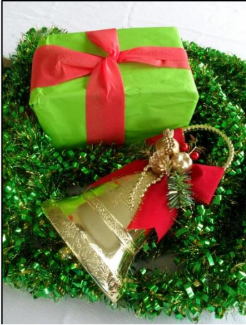
Christmas is traditional, simple and homely

Every year many of our staff leave their own families at home to help care for their other 'family' here. It is a time of closeness, laughter, special moments and much love.