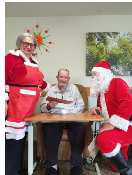
Enjoying a special visit from Santa and Mrs Claus

Rest assured that we will do all we can to keep our residents happy and comfortable during the summer months.