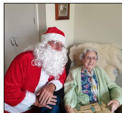
Receiving a gift from Santa brings a smile to resident's faces