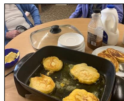
Sitting down to make some tasty treats together