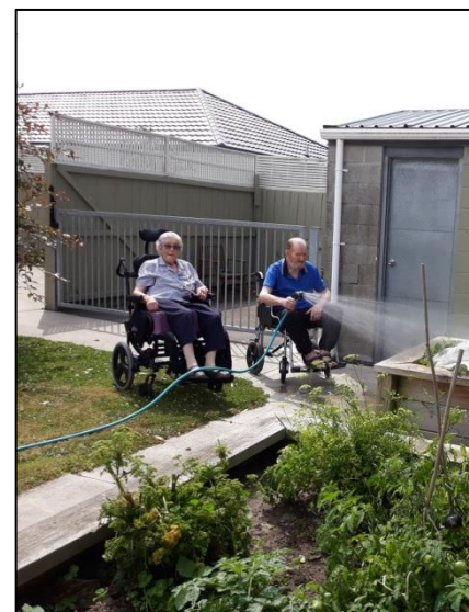
Watering the garden is an activity almost everyone enjoys on warm summer days