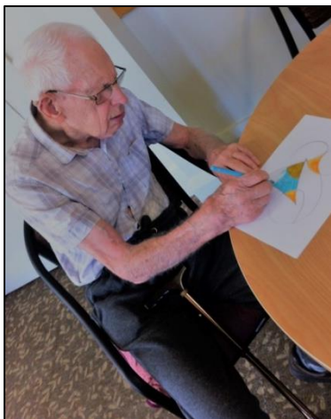
Experimenting with colour to create abstract art

If the time of the appointment does not suit you please discuss this also with the RN and they will liaise with the service provider to change the time if possible.