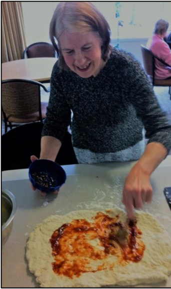
Enjoying making savoury pinwheel scrolls

Being Mortal: Medicine and What Matters in the End , by Atul Gawande, is a most important book. It challenges us to think about the 'medicalising' of old age and death and what we could offer instead.