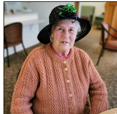
Enjoying dressing up for an impromptu "Hat Day"

Home is where the heart is, and where we all belong.