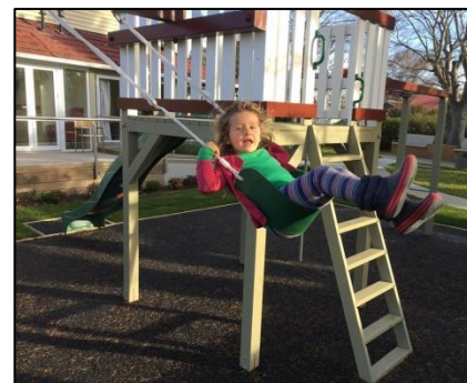
Our residents love watching children play on the recently completed playground

If possible, we would prefer you to provide non woollen clothing that is easily washed when selecting winter clothing for your loved one.