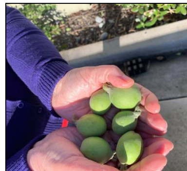
We are enjoying harvesting fruit from a number of young feijoa trees at Admatha Lodge

Multi-disciplinary team meetings are held on a regular basis to fully inform you of your loved ones general condition and care. Again, an invitation to this meeting will be given to the resident's Welfare Guardian. This invitation can then be extended by them to other family members if desired.