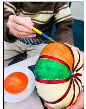
We said goodbye to Winter with a pumpkin themed week, which included pumpkin decorating

that closely mirrors a household living experience, with access to familiar homely pursuits such as showering, choosing what to wear, applying makeup and selecting jewellery, shaving, setting the table, folding linen, peeling vegetables, flower arranging, gardening, preparing and eating a meal, washing the dishes, or reading a magazine. In our small homes these interactions occur spontaneously with all staff and all residents every day, many times within a day.