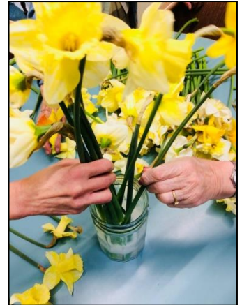
Arranging flowers is a highlight of spring

I wish each and every one of you a very happy Christmas.