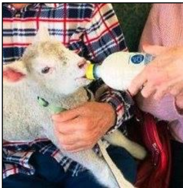
We were lucky to have a visit and cuddle with this little lamb