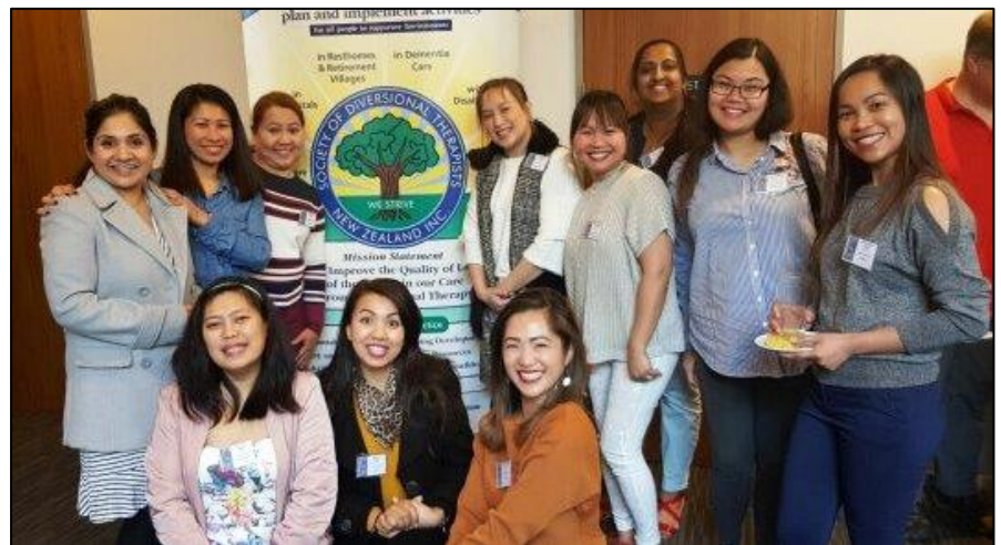
Dementia Care NZ had a great contingent at the Annual Diversional Therapy Conference in Christchurch