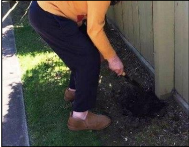
Residents enjoy helping with prepping and planting our summer gardens

Please remember that all new items need to be clearly marked with the owner's name before they arrive. This is especially important at Christmas time, when many lovingly chosen new items are given as gifts by family members. We discourage expensive woollen items, which are easily damaged in the wash. Please select easy care clothing wherever possible.