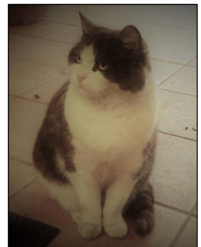
Poota, our cat, is a great favourite with residents and staff

Please choose to vaccinate this winter, and help your loved one stay well!