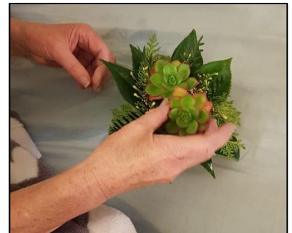
A beautiful posy being made by one of our residents who used to work as a florist.

We always welcome your ideas and concerns, and your loved one will never be disadvantaged by anything you may share with us.