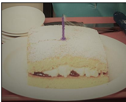
What better way to celebrate a birthday than with a home baked Victoria sponge?

Families are welcome to install a TV in their loved one's bedroom if they wish.