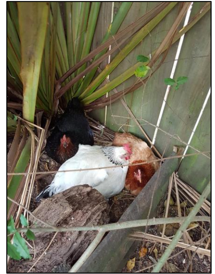
Miss Daisy the hen and her friends

The friendship of our residents is a reciprocal gift which brings joy, understanding and acceptance to our relationships with one another here in our home.