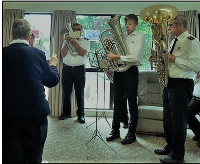
A wonderful visit from the Salvation Army Band

On a personal note, this year will be a special one for my family with the expected arrival of a new baby in March, so for us this is a time of preparation, anticipation and renewal.