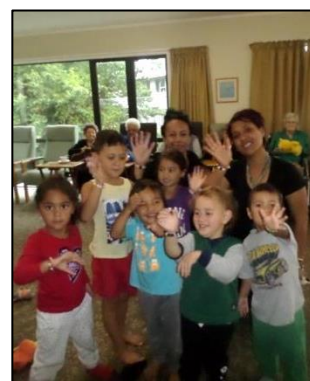
The children from JDR Child Care proudly show off their hand-made bracelets